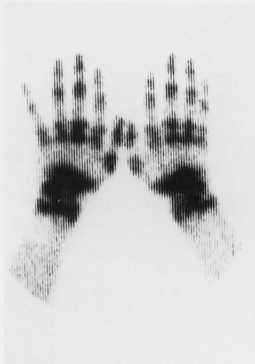
Fig. 2 Three-hour delayed image demonstrated increased osteoblastic activity in periarticular regions of the hands before therapy.

also found to be normal in this patient. Clinical diagnostic criteria for definite RSDS which were defined by Kozin et al. 5 were present in this case. Although to some authors the sensitivity of the first two phases of TPBS is not as high as the third phase in the early period (0–20 weeks after the onset of symptoms), 6,7 TPBS is a valuable examination in establishing the diagnosis of RSDS. In our patient the kinetic, blood-pool and the 3-hour delayed static images revealed increased radionuclide activity in all joints of the hands bilaterally and this activity decreased after the therapy.