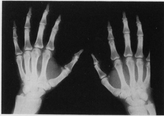
Fig. 1 X-ray graphy of the patient was normal.