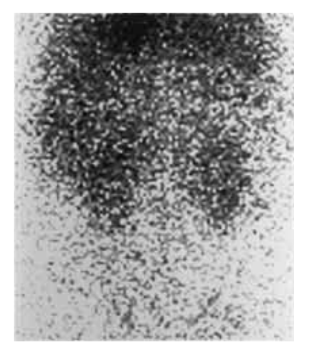
Fig. 1 Posterior dynamic flow image taken between 35 and 40 seconds after injection showing normal distribution of radiotracer to abdomen and pelvis.