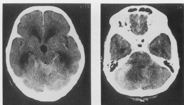
Fig. 1 CT scan revealed prominent enhancement adjacent to right cerebellar hemisphere, fourth ventricle and cerebellar vermis with low density edema in right cerebellar hemisphere and brain stem. Hydrocephalus was also detected.

We succeeded in demonstrating the tumor uptake of