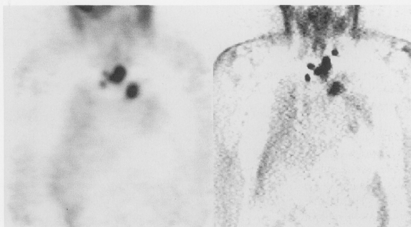
Fig. 2 A 67-year-old man with metastatic differentiated thyroid cancer. Coronal images of coincidence camera (left) and PET (right) showed increased uptake in mediastinal lymph node metastases. Whereas the contrast in the PET image was equal in all lesions, in the coincidence image it is lower in the smaller lesions. One lesion (in the left jugular region) could not be recognized in the coincidence image without knowledge of the PET results.