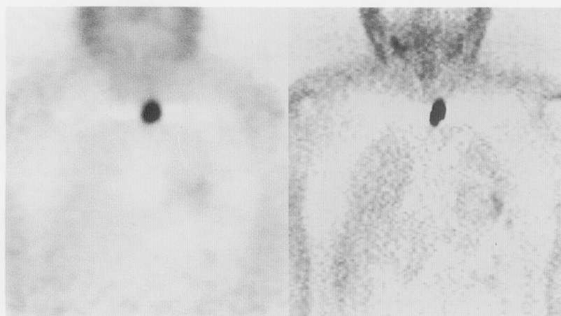
Fig. 3 A 60-year-old man was investigated with FDG because of raised thyroglobulin and (false) negative ^{131}\text{I} whole body scan. The FDG images obtained with the coincidence camera (left) and the PET scanner (right) showed increased uptake in the paratracheal region. Surgery and histology confirmed this finding.