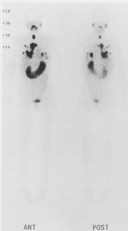
Fig. 2 Whole-body image with Tc-99m pertechnetate shows accumulation in the right thyroid lobe and in the multiple lung nodules.