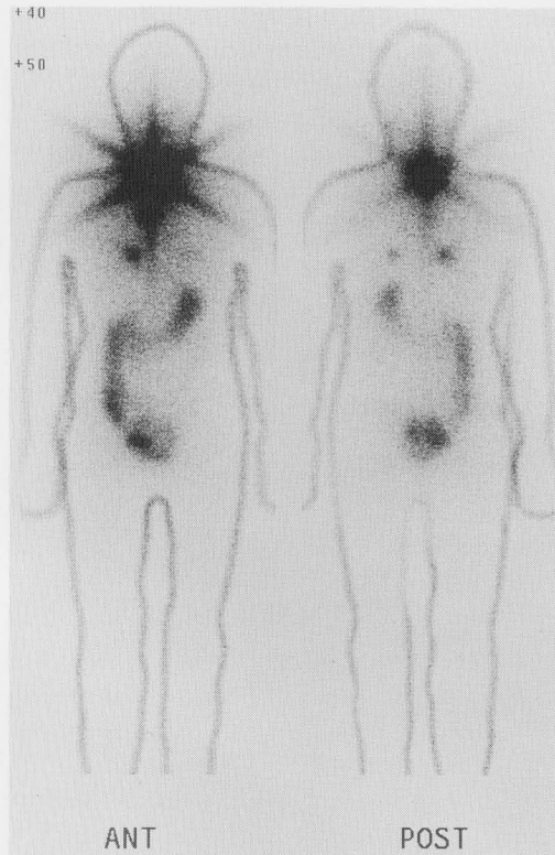
Fig. 3 Whole-body image with I-131 shows intense radioactivity in the thyroid and in the multiple lung nodules. However, the number of metastases revealed on this image is less than those show on Tc-99m pertechnetate image (Fig. 2).