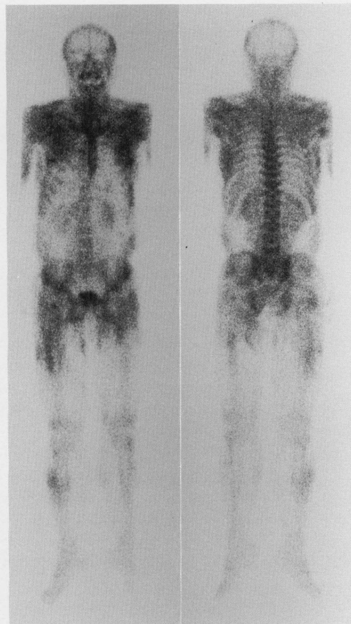
Fig. 3 Whole-body bone scintigrams with ^{99m}\text{Tc} -MDP showed extensive and intense radioconcentration in the shoulder girdles, anterior chest wall, thighs, psoas muscles and right lower limb, corresponding to the sites of symptomatic muscles.

Dermatomyositis and polymyositis are conditions of presumed autoimmune etiology, in which the skeletal muscle