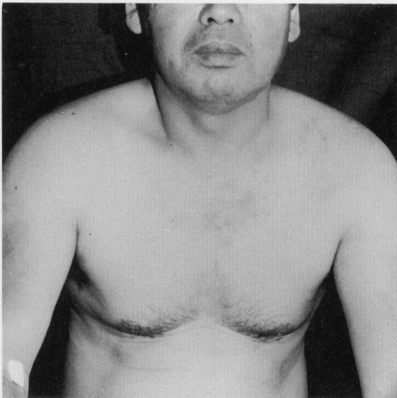
Fig. 1 Diffuse erythema and maculopapular eruption were seen in the skin of face, chest and forearms.