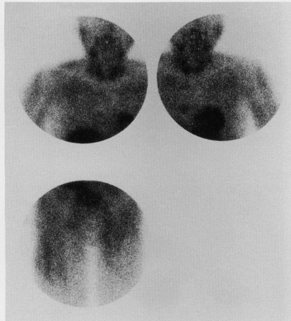
Fig. 5 Spot scintigrams with ^{201}\text{Tl} -chloride clearly demonstrated the muscle lesions with intense uptake, and also noticed the intense activity in the brachial muscles of forearms.

Interestingly, extensive intense muscle uptake of radioactivity was also shown on the muscle scintigrams with ^{201}\text{Tl} -chloride, which revealed almost the same soft-tissue distribution as ^{99\text{m}}\text{Tc} -MDP. The mechanism of ^{201}\text{Tl} -chloride uptake in the muscles involved with dermatomyositis is not clear. It appears in general to be related to its biological properties, which are similar to those of potassium. 9 It is rapidly and highly extracted by striated muscles