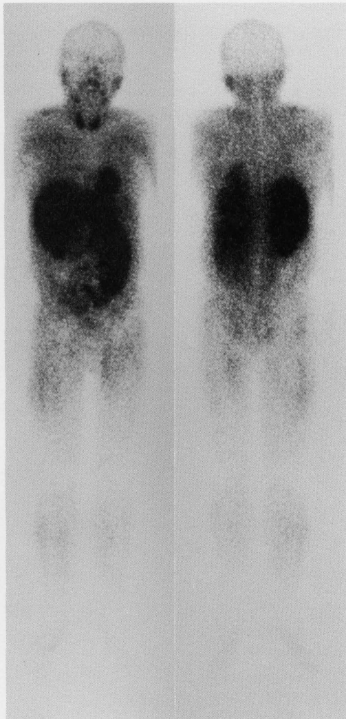
Fig. 4 Whole-body muscle scintigrams with ^{201}\text{Tl} -chloride demonstrated extensive and intense uptake in the symptomatic muscles corresponding to nearly the same sites of ^{99\text{m}}\text{Tc} -MDP abnormal uptake.

In the present case, extensive soft-tissue uptake of ^{99\text{m}}\text{Tc} -MDP was observed incidentally in both shoulder girdles, the anterior chest wall, psoas muscles, thighs and right lower limb, without calcification detection on radiographs. The skin lesions were limited, therefore, and these findings on the bone scintigrams are of clinical use in searching for occult muscle lesions affected by dermatomyositis. In fact, the muscles showing ^{99\text{m}}\text{Tc} -MDP uptake corresponded to the sites of symptomatic muscles exhibiting pain and weakness.