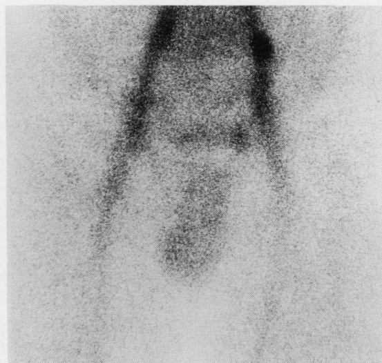
Fig. 2 Static image showing slight increased of activity in the right testicle.

high resolution parallel beam collimator and data were processed in a Scintipac 700 data processor. During working hours readings were made by more than one qualified physician and after office hours by one nuclear