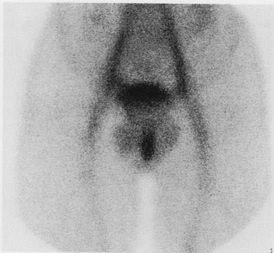
Fig. 3 Static image showing a focal photon deficient area in the right testicle.