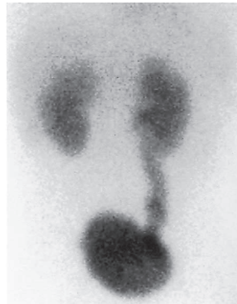
Fig. 3 ^{99m}\text{Tc} -DMSA scan (anterior projection) demonstrates almost equal cortical function bilaterally. Dilated left ureter is visualized.

urine in an unchanged form and 8–17% of the injected dose is excreted in the urine by the end of the second hour. 6 This fact needs to be considered when interpreting scans with possible reflux or obstruction. 9