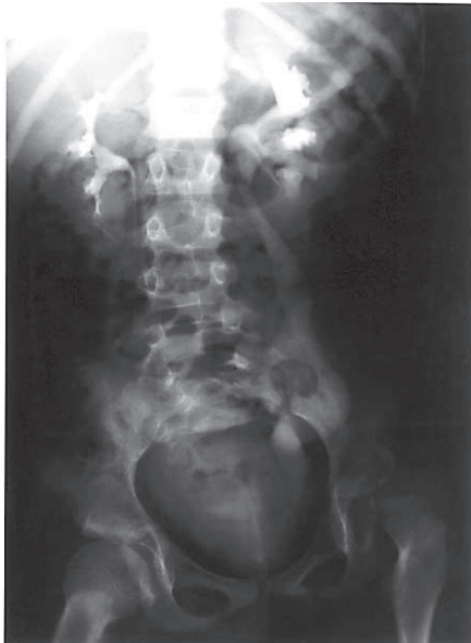
Fig. 2 Intravenous urography shows dilatation of the pelvicalyceal system of the left kidney, dilatation and tortuosity of the left ureter and sharp cutoff at the ureterovesical junction.